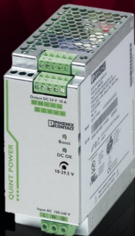
Primary Power-supply 100-260 VAC, 18-32VDC

Please note - The Lopolight NLC solution only works with Lopolight Navigation Lights.