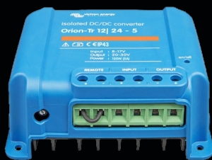
Isolate DC/DC converter