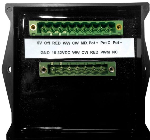
400-144: 10 light power electronics